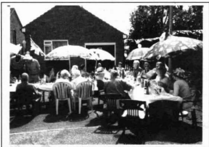
Golden Jubilee Street Party in Chestnut Close